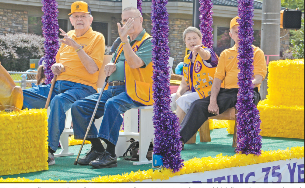
Parade, pictured here.